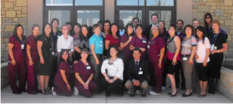
The staff of Salud-Fort Morgan gather in front of their new building.