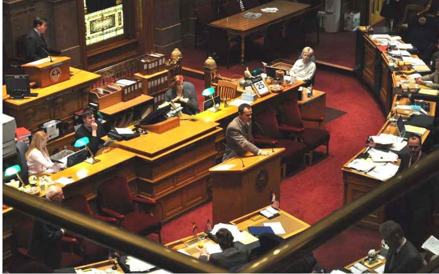
Rep. Spencer Swalm speaks about Community Health Centers before the Colorado House of Representatives on March 25, 2010.