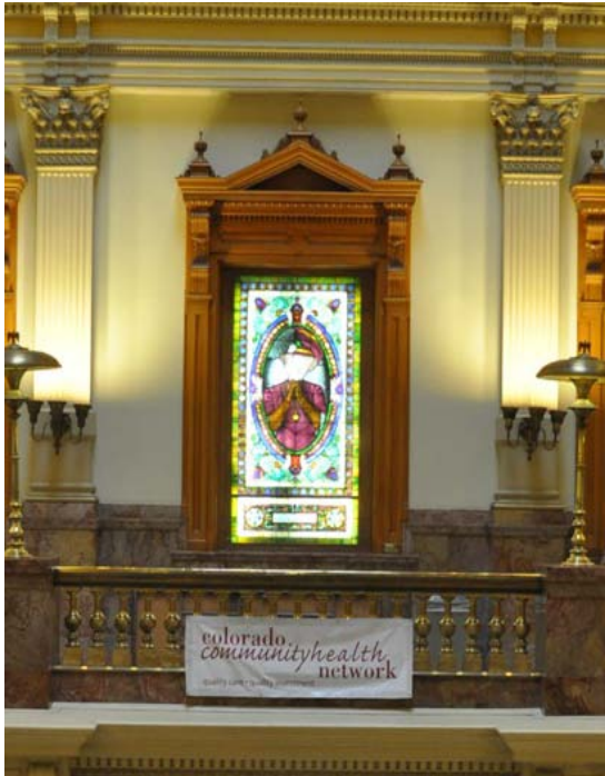
The CCHN banner hangs outside of the Old Supreme Court Chambers at the Colorado State Capitol on March 25, 2010.

representatives spoke on behalf of CHCs, and support was so strong that all members present in the House and the Senate at the time of the votes were added as cosponsors of the legislation.