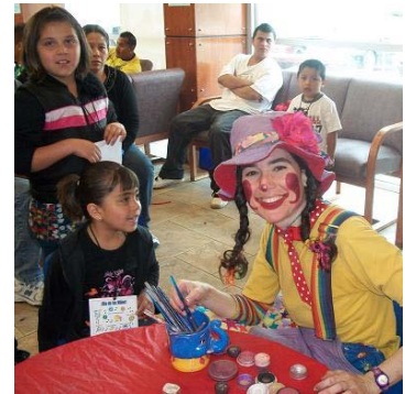
Children line up for face painting at Salud-Longmont's Dia de los Niños event April 30, 2010.

Salud-Longmont hosted 600 participants at its twelfth annual Dia de los Niños on April 30, 2010. Salud staff provided immunizations, dental and developmental screenings, health education, CHP+ and Medicaid enrollment, community resource booths along with games, entertainment and raffles.