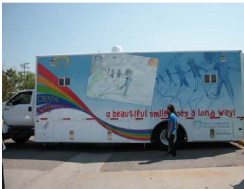
MCPN's mobile dental van opening celebration, Aug. 9, 2012

included an awards ceremony for the winning students of the dental van art contest, healthy snacks and refreshments, and guided tours of the van.