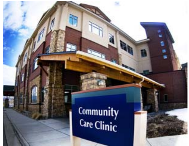
Summit Community Care Clinic, Frisco, CO.

Summit Community Care Clinic, located in Frisco, joins the Community Health Center family with its new designation as a “look alike.” Summit Community Care Clinic was established in 1993 as a one-night-a-week walk-in clinic staffed entirely by volunteers and managed by Summit County Public Health. Over time Summit added extra evening hours and eventually day-time hours. In 2006, Summit became an independent non-profit and separated from Summit County Public Health. Summit attained its CHC status in September 2012.