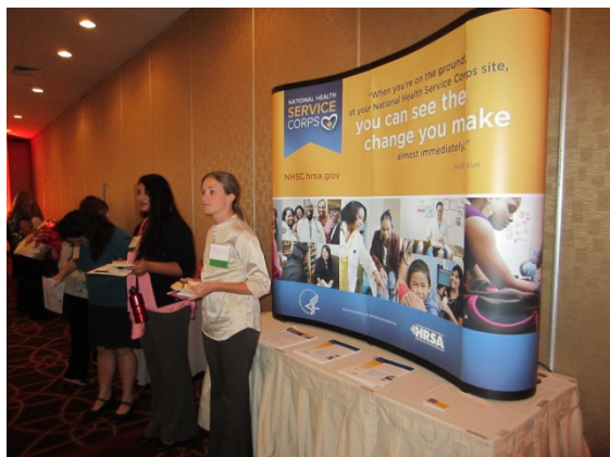
Participants stand near the NHSC display at the Corps Community Day event.

Health professionals who help make up Colorado's health safety net gathered at the Corps Community Day event in Denver to network on Oct. 11, 2012. Five Colorado Health Service Corps and National Health Service Corps (NHSC) loan repayment recipients were celebrated for the difference they are making in their communities.