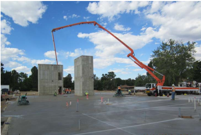
Construction proceeds on JFHSC site

Demand for MCPN's services has more than doubled in the past few years, so MCPN is working hard to build the capacity to provide health care for more Coloradans. MCPN will be opening five new, renovated, or expanded sites by April 2013.