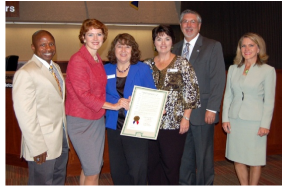
El Paso County Board of Commissioners name Aug. 5-11 Peak Vista Community Health Centers Week in El Paso County.

Additional activities during the week included sports physicals for students preparing to return to school, block parties combined with health fairs, free immunizations, voter registration, health education sessions presented by CHC staff experts, and picnics.