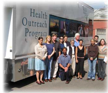
CCH's Health Outreach Program staff pose in front of the new health outreach van.

Serving the hardest-to-reach communities, this van is the center of the CCH's medical outreach. The HOP regularly provides services to parents and children living in motels along East Colfax Avenue and working homeless who can't access daytime health services due to jobs or other daily commitments. As part of its regular duties, van staff members work closely with CCH's street outreach team to help chronically homeless individuals who are often the most difficult population to serve. The HOP regularly visits motels as well as at least four shelters and day centers serving Denver's homeless population.